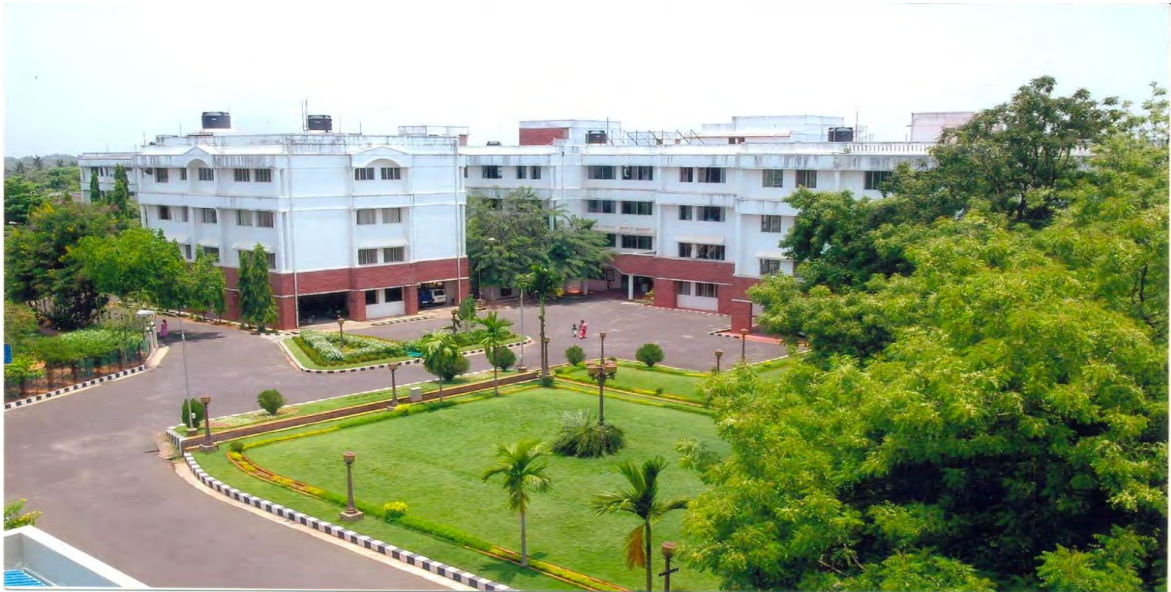
POSTGRADUATE INSTITUTE & HOSPITAL BLOCKS - MGPGI