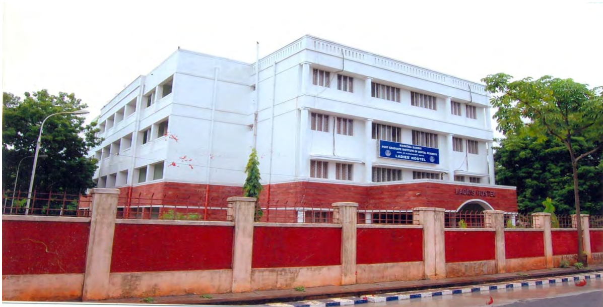
LADIES HOSTEL - MGPGI