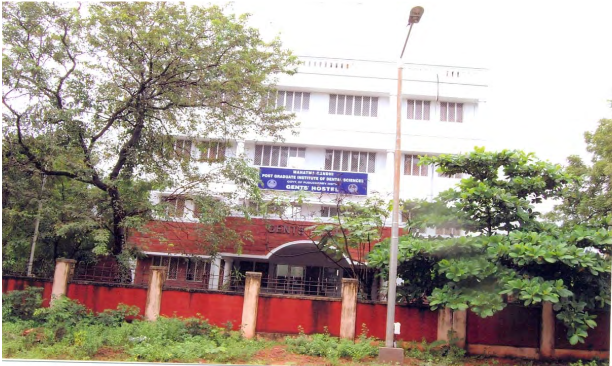
GENTS HOSTEL - MGPGI