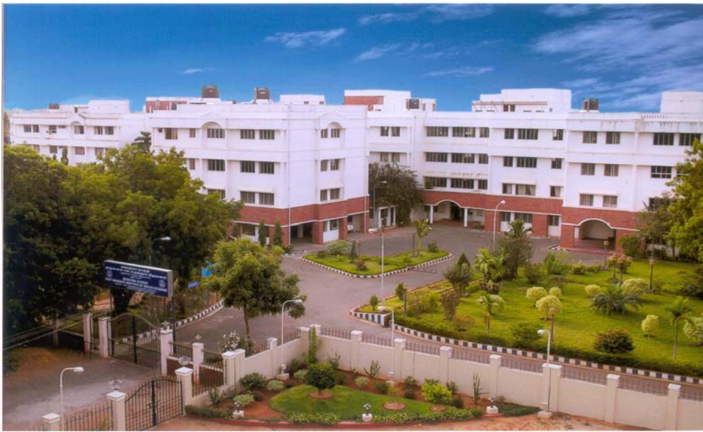
POSTGRADUATE INSTITUTE AND HOSPITAL BLOCKS - MGPGI